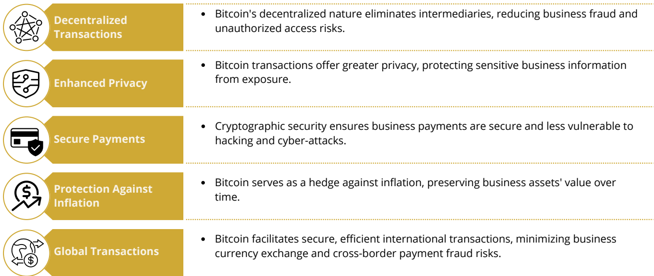
Figure 2: Transformation of Security in Businesses with Bitcoin

By leveraging these capabilities, businesses enhance security measures, ensuring more reliable and tamper-resistant transactions and operations.