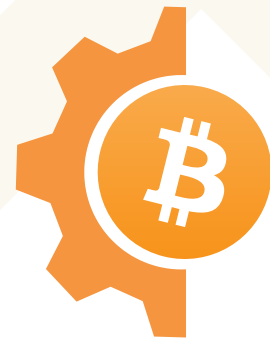
Figure 4: Key Steps to Integrate Bitcoin in Security Practices

By following these steps, you can effectively integrate Bitcoin into your security practices to enhance overall security.